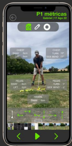
Top analysis tools and data capture