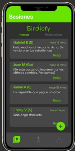
Store all your sessions